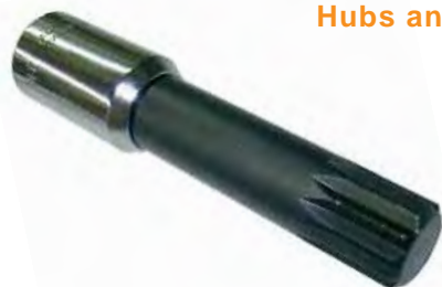
Hubs and Bearings