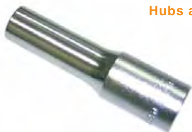
Hubs and Bearings

Estrattore per mozzi e giunti omocinetici montati su modelli VW-Audi.