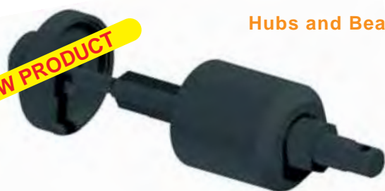
Hubs and Bearings

Chiave per smontaggio mozzi posteriori modelli Renault.