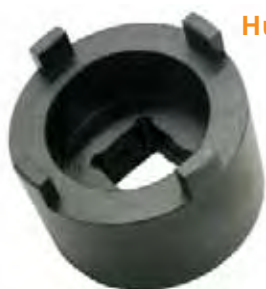
Hubs and Bearings

Chiave XZN 18 mm. adattabile allo smontaggio dei mozzi sui veicoli VW Golf, serie V.