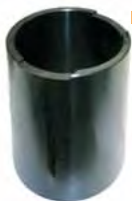
Hubs and Bearings