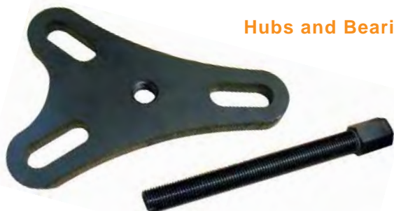
Hubs and Bearings

Distanziale per estrarre e introdurre cuscinetti VW Golf IV-Audi /A4.